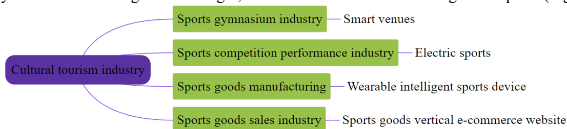
Figure 2 Infiltration and integration with sports tourism industry

The infiltration and integration with sports related industries is generally the infiltration and integration of cultural tourism industry with sports industry, and forms a kind of integrated development mode of sports information format. At present, under the development trend of "internet +" in China, the industrial penetration of network information technology into sports industry will become stronger and stronger, which is shown in the following four aspects (Figure 2).